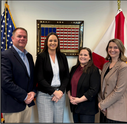
Staff attended Rural Counties Day in Tallahassee in January