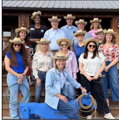
The Regional Tourism Leadership Team enjoyed a retreat in February