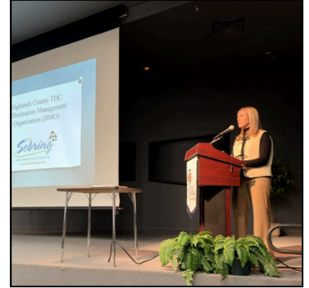
Staff presented to SFSC Lifetime Learners in January